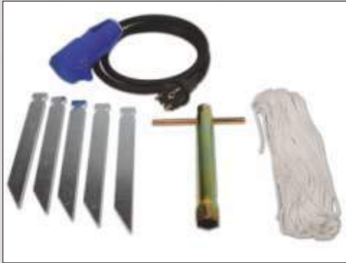
Scope of delivery: Coupler, fastening material and ground anchor, spark plug spanner.