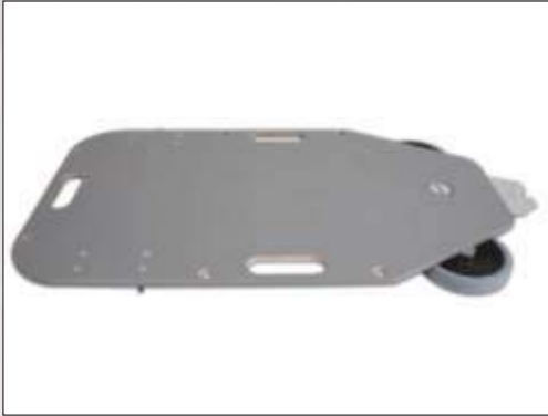
The Safeline Mobil: Slimline and powerful up to a load of 150 kg, foolproof operation. Article no.: 2859 (special accessories)