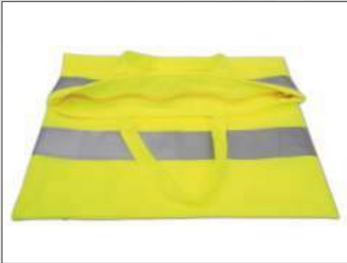
Sandbag signal yellow Article no.: 2736 (special accessories)