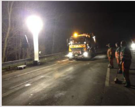
The grip handle and tensioning rope always ensures a secure stand of the luminous post.