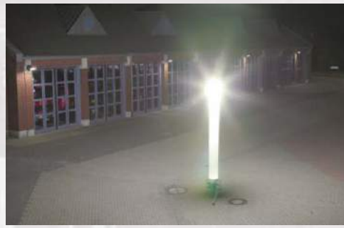
The air hose is filled and straightened up by two powerful compressors and can be moved or carried on the transport cart to any place that requires lighting. This is also possible while in operation.