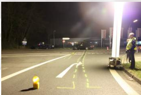
The device can be operated immediately after the protective cover has been removed.