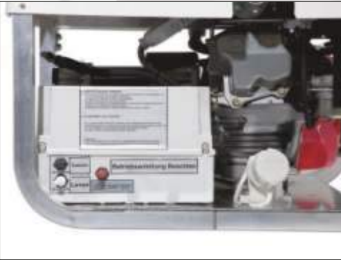
Easy and centralised control