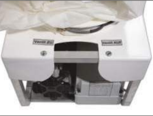
A stable aluminium support frame with carrying device