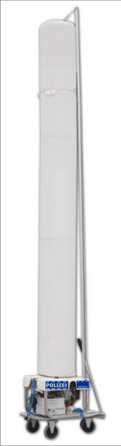
The Safeline Tower with the Safeline Mobil Article no.: 992004-TS