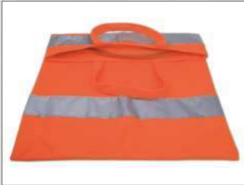
Sandbag signal orange Article no.: 2737 (special accessories)