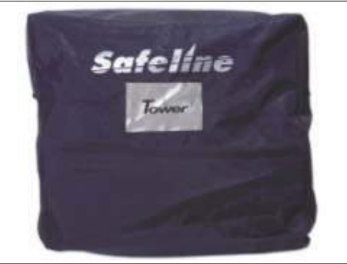
Weather-proof and heavy-duty protective cover