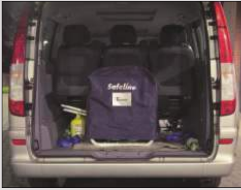
Thanks to its compact design it normally fits into any trunk.