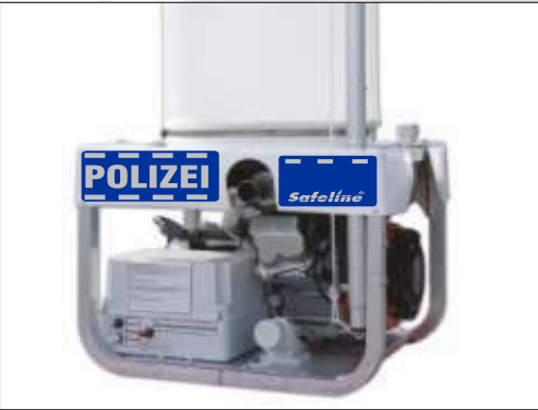
Stability of luminous post is always ensured by means of a telescopic bar and tensioning rope. (special accessories)